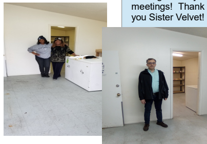
Clean up day- AFTER