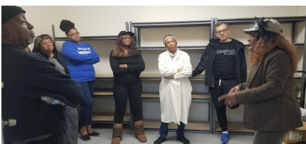
Planning for Cleanup!