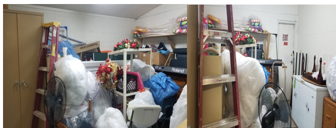
Clean up day- BEFORE

Suryea for volunteering to make our thank you cards! Pathfinders for joining us with the community walk! Brother Lawrence Rawls for the truck load of noodles! Sister Pat Everson for donating all the shelving! Pastor Chad for helping with the loading and unloading!