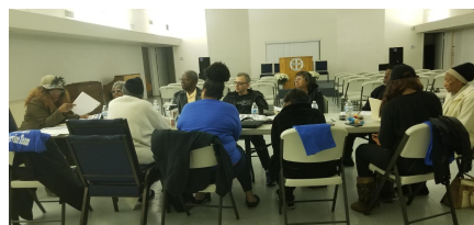
Planning for Walking!