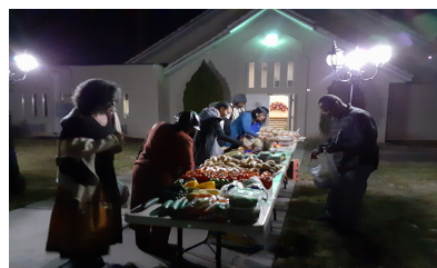
Wednesday night give away!